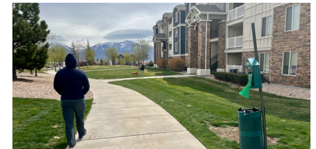
Above & right: People walking on paths in Herriman