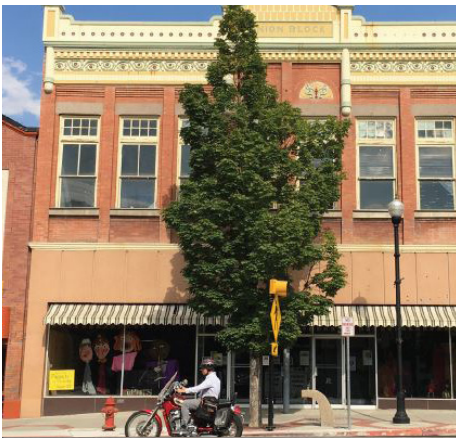
Brigham City Main Street.

Brigham City utilized the TLC Program in order to advance their high quality of life while preparing for growth. Through the development of the updated General Plan, the City's priorities became clear: work toward keeping the small-town feel, create a balanced community with a diversity of land uses, improve appearance, and be equipped with the necessary tools to prepare for their future. One of the major strategies that advances these priorities is to revitalize the Historic Downtown.