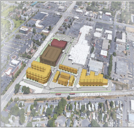
West Jordan City Center Rendering.

West Jordan City has been awarded several Transportation and Land Use Connection projects since the inception of the TLC Program.