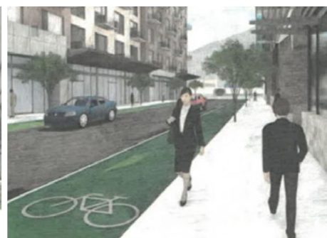
Pedestrian friendly public ways