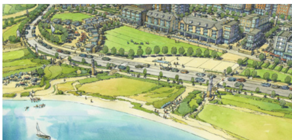
Vineyard Station Area Plan, with artist representation of development