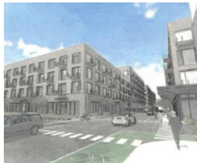
Mixed-uses at various scales