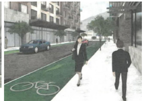
Pedestrian friendly public ways