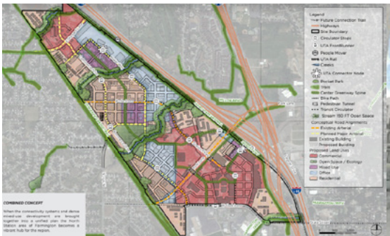
Farmington North Station Plan

Farmington City adopted a Station Area Plan for the Farmington North FrontRunner Station. The SAP includes an implementation timeline for the next 5 to 10 years which will activate the area to become a connected, mixed-use development containing residential housing (market rate and affordable), office/commercial, and open space uses. The plan seeks to expand housing choice and availability around the station, including approximately 4,500 new residential units - enough to accommodate nearly 15,000 new Farmington residents. Under the SAP, Farmington will explore innovative alternative transit options to connect people within the station area (which can be more than ½ mile) to the station and a mixed-use center, which the city has already initiated.