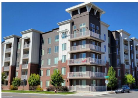
Midvale Center Station

A few newer, higher-density mixed-use and residential developments, some affordable, have been built near the Midvale Fort Union and Midvale Center stations. An existing Station Area Plan (2019) encompasses both of them. This plan now will be updated to address the requirements of HB462. As with the Bingham Junction area, Midvale looks forward to what the new station area plan proposes for these areas; specifically, how to improve and better utilize existing zoning opportunities for transit-oriented growth.