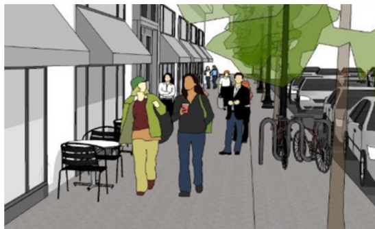
Pedestrian friendly public ways