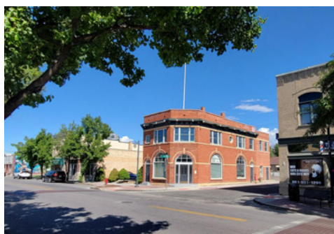
Historic Downtown Midvale