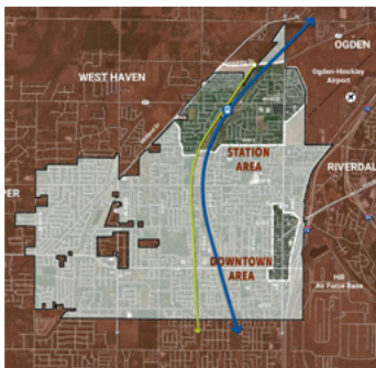
Focus Roy City SAP