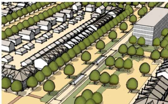
Higher density around FrontRunner station

After extensive public engagement, Roy City created the Focus Roy City vision for their community, which then led to the adoption of a Form Based Zoning Code for their FrontRunner Station. Roy's Form Based Zoning Code will help transform the station area through zoning changes into a transit oriented development with a mix of uses, including affordable housing options and office/commercial development, as well as connectivity for pedestrians and bikers to best leverage the development's proximity to public transportation. This plan is beginning to come to life as the market responds with a proposal to construct nearly 300 townhome units within the station area.