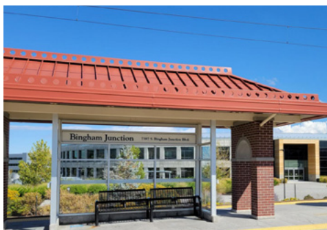
Midvale Bingham Junction Station