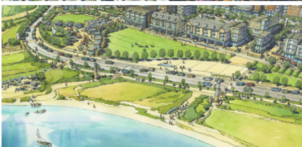
Vineyard Station Area Plan, with artist representation of development