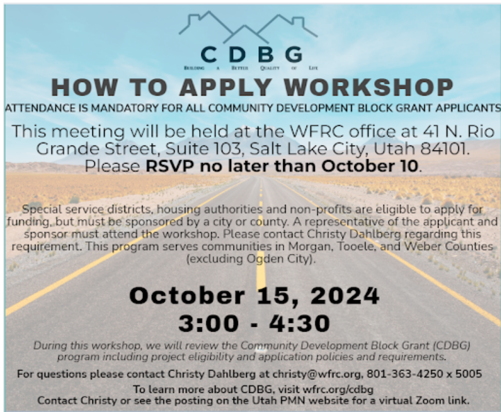
Figure 2. Flyer Noticing the Region's How to Apply Workshop

Each applicant holds a public hearing in order to inform and receive feedback from the general public on potential CDBG projects. There are on average 6 public hearings held throughout the region seeking public input each year. WFRC has record of these public hearings and minutes from the hearings that detail the comments and responses made. The public hearings are noticed in local newspapers and via the Public Notice Website, and published at least 7 days prior to the public hearing date. The hearings are held in public places and at times that are usually best for the most public participation. Local elected officials, in addition to staff, attend the hearings.