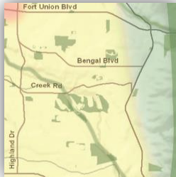
Scenario 1 Less Centered