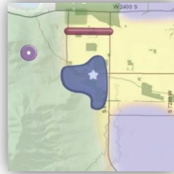
Scenario 2 Consistent w/current Plan