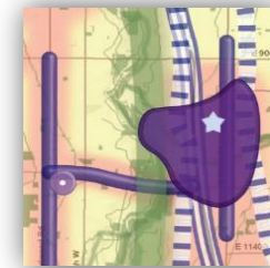
Scenario 4 Most Centered