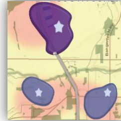
Scenario 3 More Centered